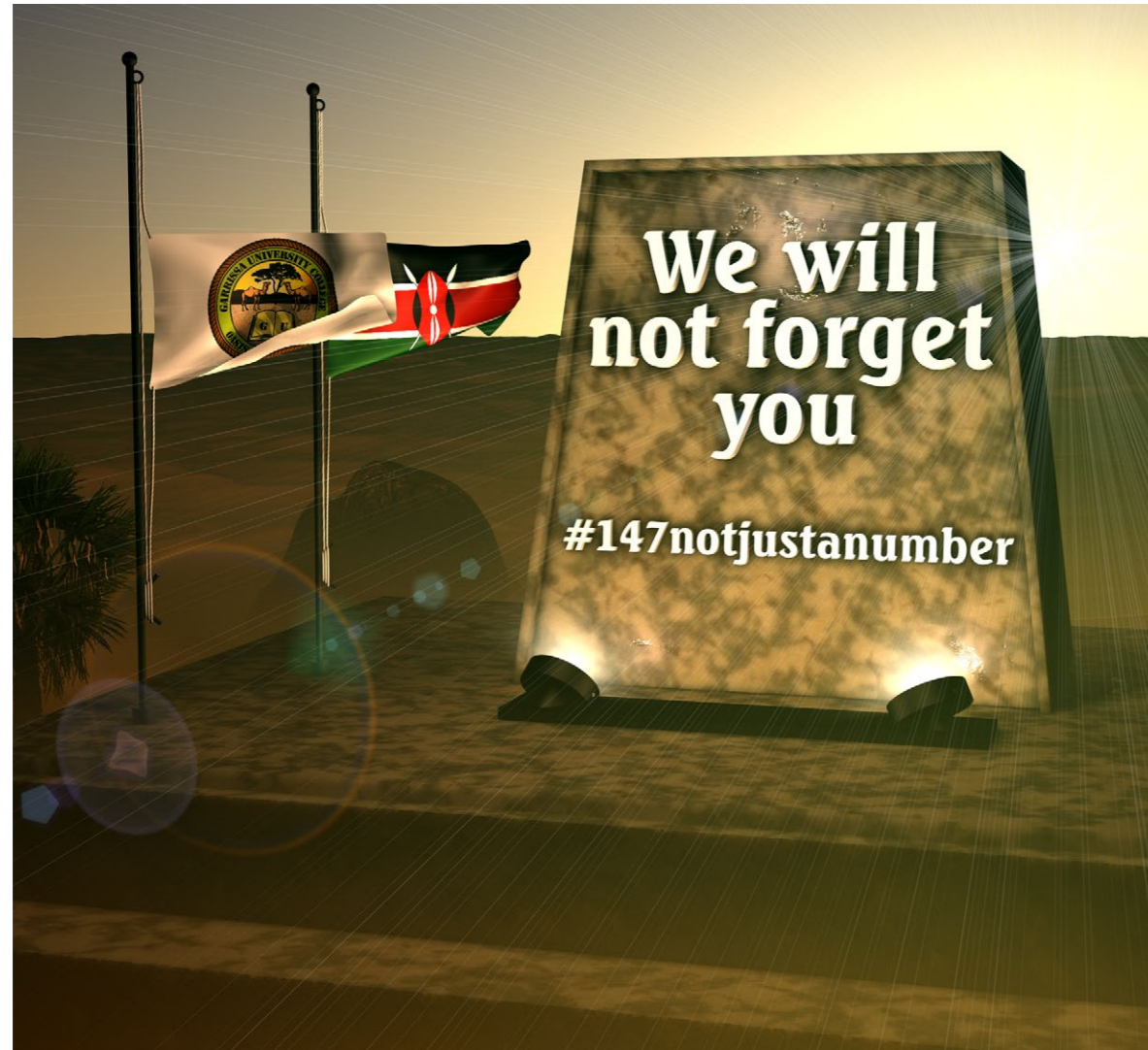
Tribute to Garissa Victims